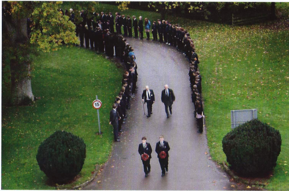
Remembrance Day Tribute 11.11.2013